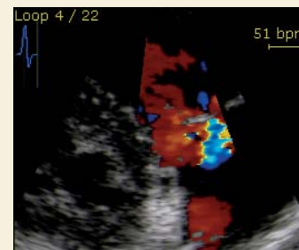
MDR RGB input to DICOM output

compare the MDR image quality, clarity and details with its competitors: